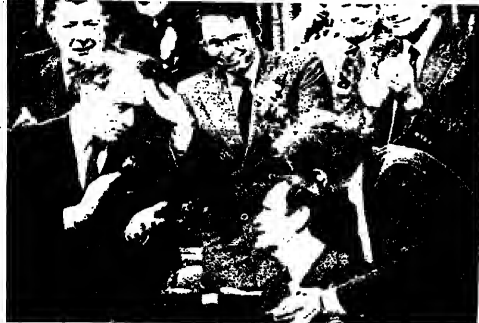
HISTORIC DEBATE: Canada's Justice Minister Jean Chretien is applauded in the House of Commons Tuesday by Prime Minister Pierre Elliott Trudeau and other members of parliament after delivering the opening speech of a historic debate on Trudeau's constitutional reform plan.

In Paris, French Foreign Minister Jean Francois-Poncet said Tuesday after meeting Lawrence Eagleburger that France could only condemn foreign support for leftist Salvadoran guerrillas if such outside interference was confirmed.